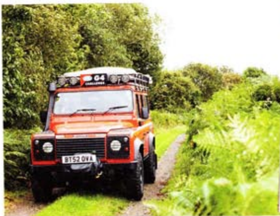
Greenlane No 2: worth coming here for this enticing complex alone

As always, we're heading from the mouth of the river to its source, taking in the best greenlanes on the way. We're following two rivers – Ouse and Ure – but they're really the same thing, the Ure becomes the Ouse at Linton, near York.