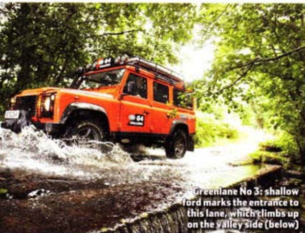
Greenlane No 3: shallow ford marks the entrance to this lane, which climbs up on the valley side (below)

café on the A19 at nearby Cropley Hill. Then we're following the river – it's the Ure now – to the west side of the AIM, en route to the Yorkshire Dales National Park.